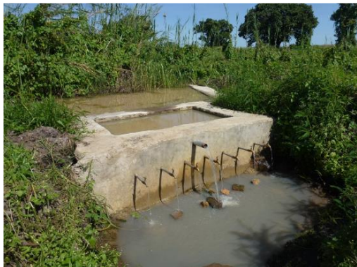
A water source improved at Haterere village, Mbozi District