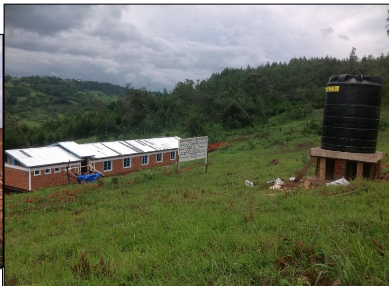
Above: A complete Dormitory for Boys at Madilu Ward secondary school, Ludewa District. The dormitory carries 48 students at once, supplied with water and Solar power for lighting, tables and chairs

SHIPO's aim, is to contribute effectively to a sustained improvement in the living standard of poor people in Tanzania