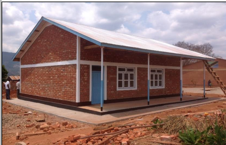
Above: One of the Classes constructed by SHIPO through MAMMIE project at Mkiu primary school, Ludewa District