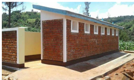
A complete latrine block for boys at Lufumbu primary school, Ludewa District