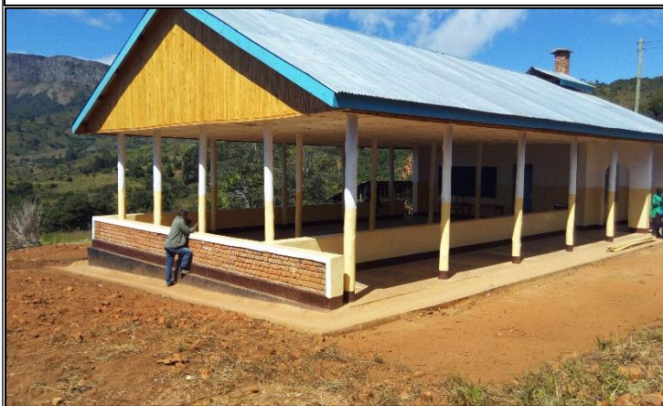
Above: One of the Dining halls with Kitchen constructed by SHIPO through MAMMIE project at Ligumbiro primary school, Ludewa District

SHIPO's aim, is to contribute effectively to a sustained improvement in the living standard of poor people in Tanzania