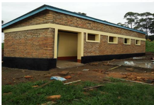
A complete Latrine block for boys at Iwalanje primary school, Mbozi District, Songwe region