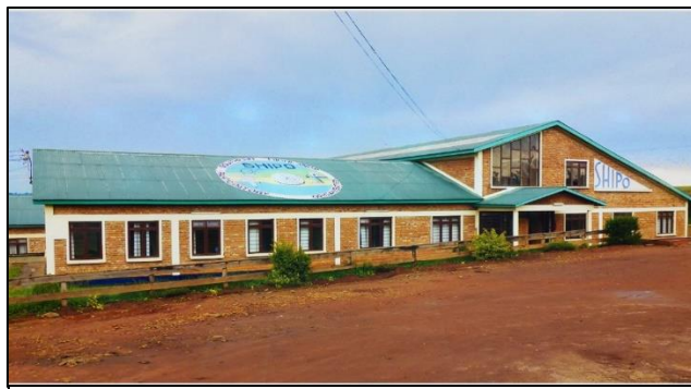
SHIPO Building, Njombe opposite with NSSF Building

Involved programs are increasing teachers' competencies, Improving schools' learning environment and infrastructures, Awareness raising and improving nutrition to school pupils and parents, awareness raising in reproductive health, HIV/AIDS, Gender, Child rights and protection and