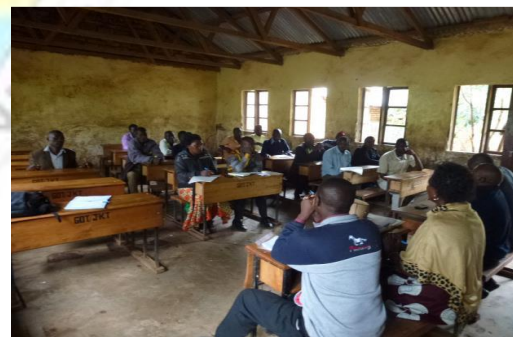
Inception meeting at Isansa primary school

The meetings were participated with village council including the heads from 10 primary schools, water committees and school committees' representatives, from 10 villages, where MFLI project has covered. The meetings objective focused on water related issues especially on the plans for the new construction of ground tanks for rain water harvesting within 10 primary schools in 10 villages. The total of 178 people participated where 129 were females and 49 males.