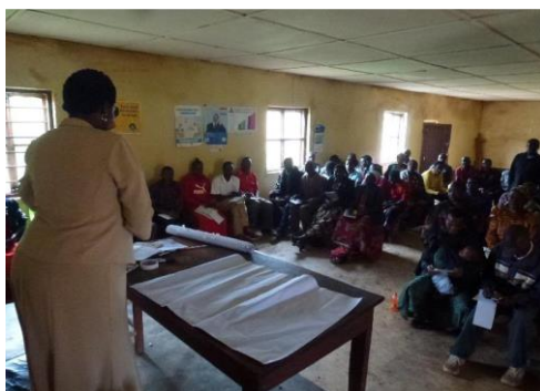
COWSO formulation at Igamba village, Mbozi District, Songwe region

Community Owned Water Supply Organizations (COWSOs) are the entities authorized in the villages for the management of all water resources and infrastructures and are recognized by the government of Tanzania