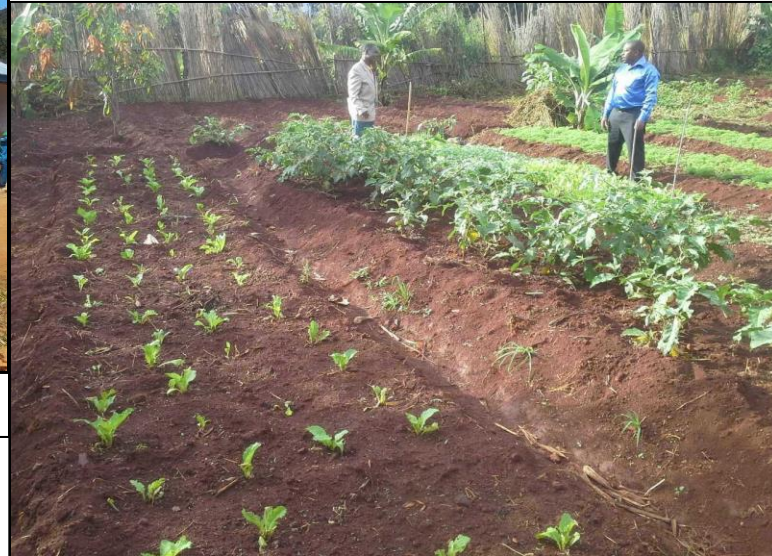
Above: One of the School vegetable gardens for pupils' meals through MAMMIE project, at Mawengi primary school, Ludewa District

Many thanks to our Partners, Supporters and other Stakeholders for their support and contributions