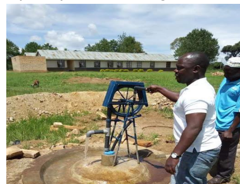
A complete water point for Isansa primary school and village